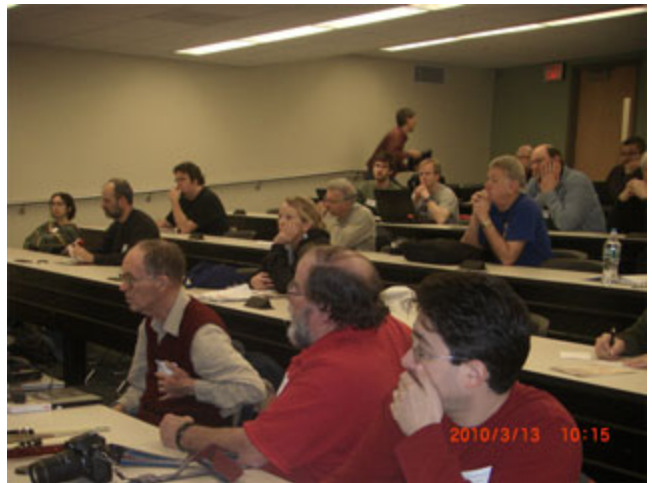
Audience at a Parallel Session: Contributed Talks